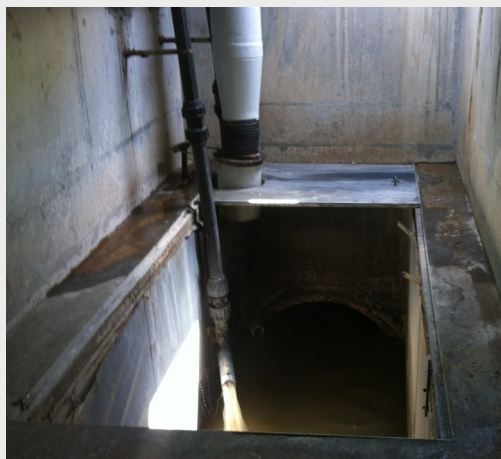
The City of Salalah (Sultanate of Oman) wastewater collection system's inlet for main pumping station #2 – air extraction and chemical dosing.